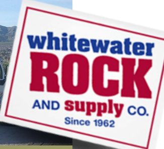
Thank you Whitewater Rock & Supply for more telephone poles.