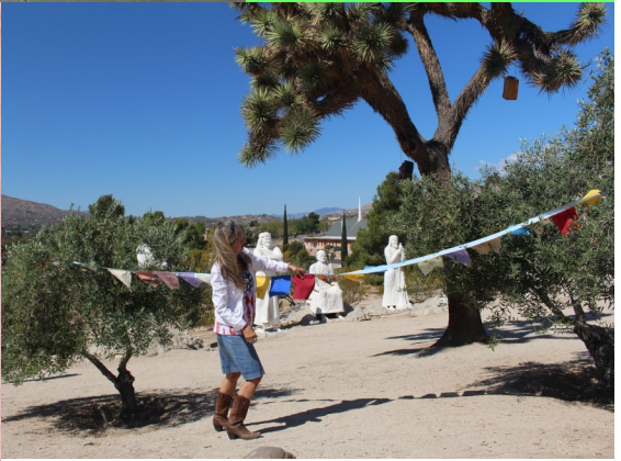
2018 National Day of Prayer - Prayer flags hung through the Park - Lifting prayers in the wind Thursday, May 2, 2019 - 10 am to 2 pm - 2019 National theme is "Love One Another"

We continue in 2019 with many annual events. You will want to join us! Palm Sunday Tour, Thursday Experience the Last Supper, Easter Egg Hunt, National Day of Prayer, 4th of July Fireworks viewing, Pink Ribbon Event, and Christmas Treasure Hunt. (see page 4)