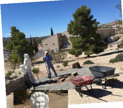
Samaritan Woman and Jesus at the Well, fully restored in 2018.