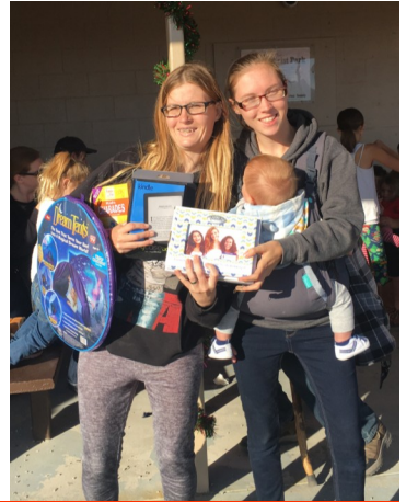
2018 5th Annual Christmas Treasure Hunt - Everyone went home with something for Christmas - Raffle Prizes too