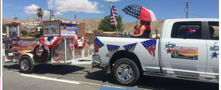
Parade entry for Grubstake Days 2018. Beautiful weather in May.