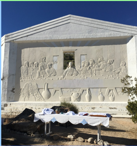
Experience the Last Supper on Holy Thursday.