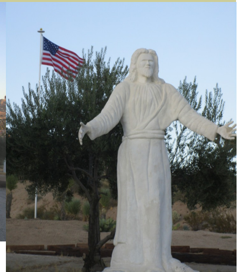
New flag and pole installed in time for Labor Day!

Thank you to the Palm Springs Air Museum for sponsoring our flag in 2019.