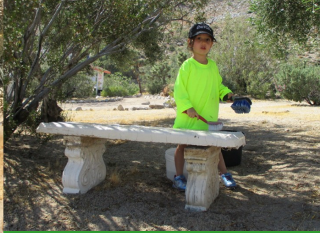
A new bench added in the shade of the olive trees.