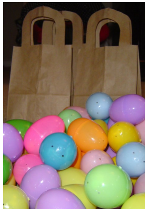
We had 750 eggs donated for our annual Easter Hunt.