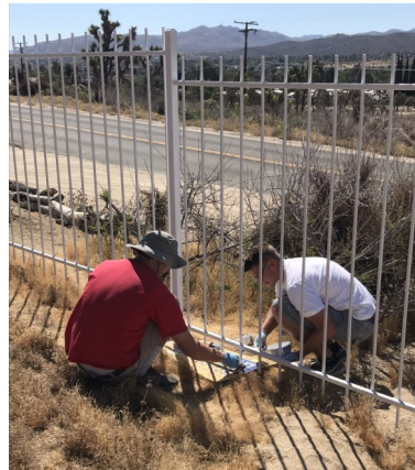
A great workday to paint our front fence by The Church of Jesus Christ of Latter-day Saints. A lot of progress was made. Their support is outstanding.