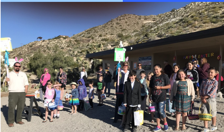
Kids and adults enjoy Easter Sunday, April 21st, 2019. Many children hunt for eggs and receive raffle prizes.