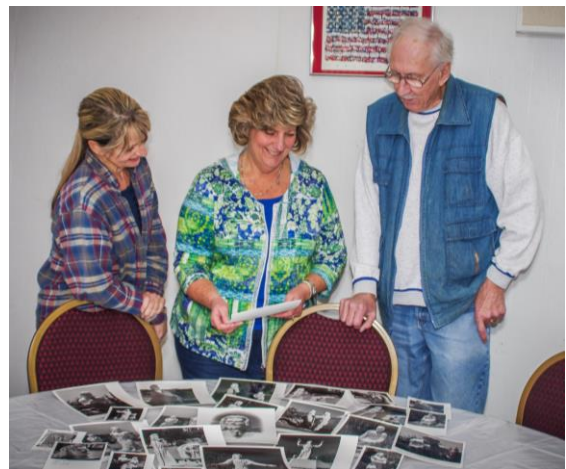
Plans are underway!