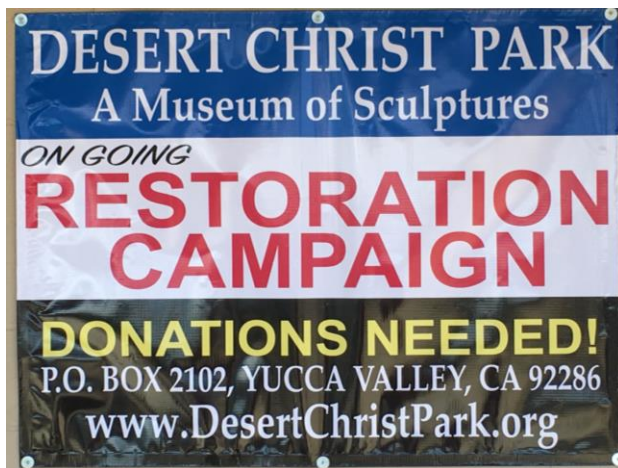
Banners hung at the Park!

New entrance signs are on order. After many design ideas from all volunteers a final decision was made. We will have a ribbon cutting soon. Excitement is building for more restoration projects around the Park. Stay tuned!