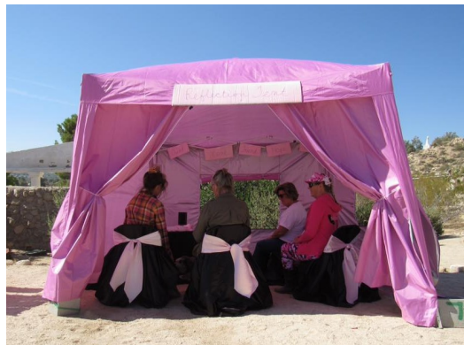
Supporting the Fighters, Admiring the Survivors, Honoring the Taken, and never, ever giving up Hope!