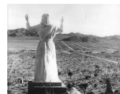
Christ statue overlooking Yucca Valley in 1951.

"Were you born here on the desert?" we found time to ask. "Quite the opposite. I'm an adopted citizen. City raised. Used to be a traveling evangelist; on my own and with some of the biggest names in the business. Four pole tents and twelve piece bands. I've got a wife and two kids now. That razzle-dazzle