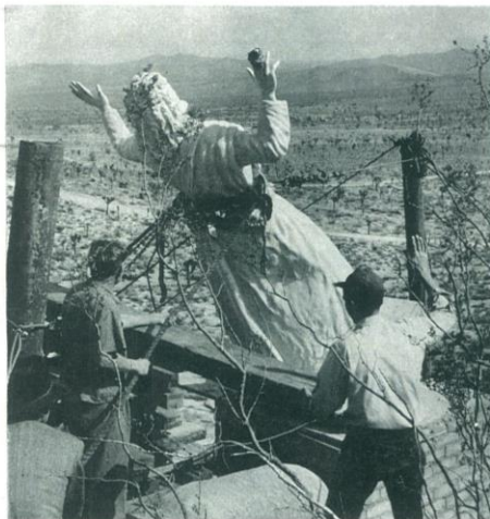
SAFELY ON TOP, the concrete Christ—damaged right hand patched and wrapped—is guided onto the pedestal as Garver (right) signals to stop heaving.